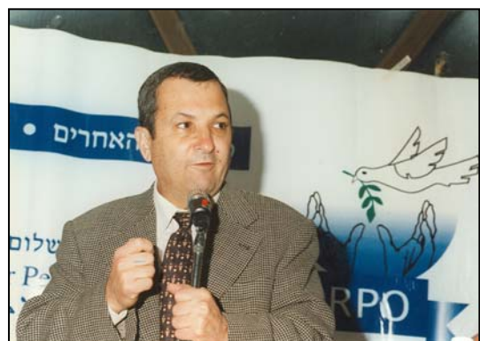
Speaking: Mr. Ehud Barak