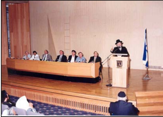
Rabbi Meir Lau Giving a speech - Knesset