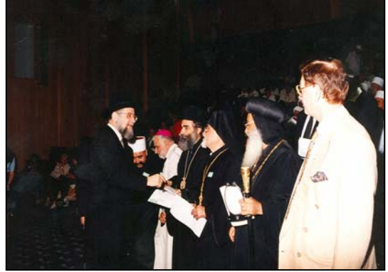
From left - Rabbi Meir Lau