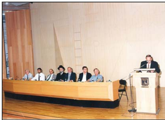
Prof. Shimon Shetreet Giving a speech

On the 15 th of July 1997, the RPO organized a major conference at the Knesset on Religion for Peace, attended by 500 people including many different religious and political leaders. Chief Rabbi of Israel, Rabbi Meir Lau, presented a lecture about peace in Judaism and MK Dan Tichon, speaker of the Knesset, offered greetings.